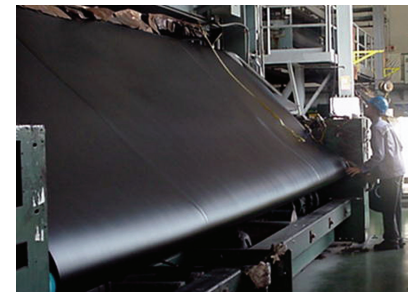
GSE flat die extrusion process

GSE is a leading manufacturer and marketer of geosynthetic lining products and services. We've built a reputation of reliability through our dedication to providing consistency of product, price and protection to our global customers.