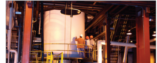
GSE round die extrusion process