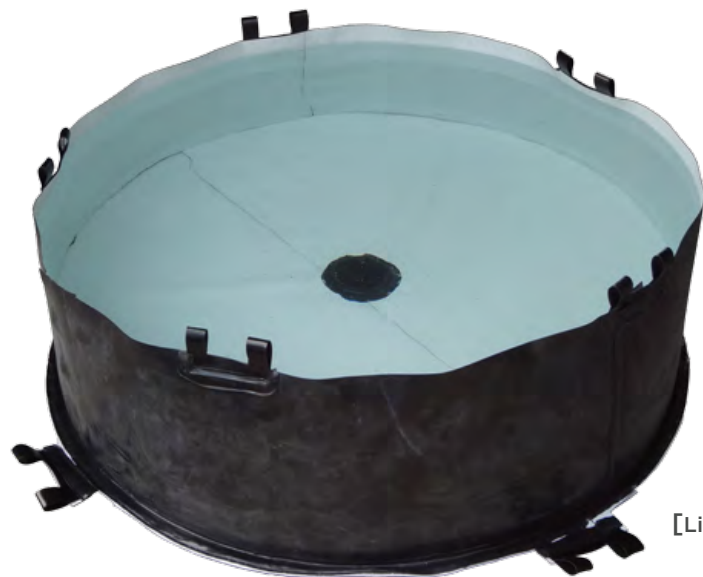
[Liquid Containment Tank]

Our Custom Fabrications Group has extensive experience in prefabricated polyethylene products and components, and is able to create purpose-fit solutions for virtually any need. We know that being a leader means not being satisfied with the status quo. So we're continually improving on our existing products and services and developing new ones. If you have a custom lining project on your horizon, we'd like to talk with you. Please contact us at 800-435-2008.