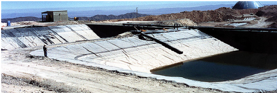
[GSE White Pond Evaporation]

We offer a complete line of products and installation services to meet your specific water containment and treatment needs.