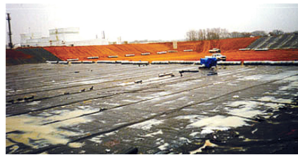
[GSE GundSeal in a food processing Sludge Lagoon]

Whether the choice is GSE BentoLiner or GSE GundSeal to provide an economical alternative to your compacted clay water containment requirements, GSE provides the widest range, most versatile, and highest quality GCLs in the world.