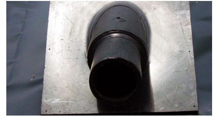
[Bootless Pipe Penetration]

chambers, and vertical flow control baffles, GSE provides prefabricated geomembrane panels for the client's own installation. GSE Custom Fabrication is available to fabricate specialized size and dimensions to custom fit your containment structure.