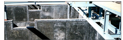
[GSE Liner in wastewater treatment aerobic digester]