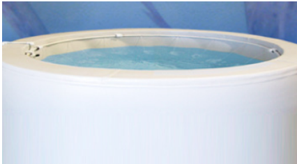
[GSE Aqua Tank]

Effective erosion control is another significant advantage of a GSE lining system. The liner eliminates slope deterioration caused by surface rains, wave action and wind. The liner prevents eroded materials from filling the pond and reducing the volume. In addition, costly erosion repair and dredging are eliminated.