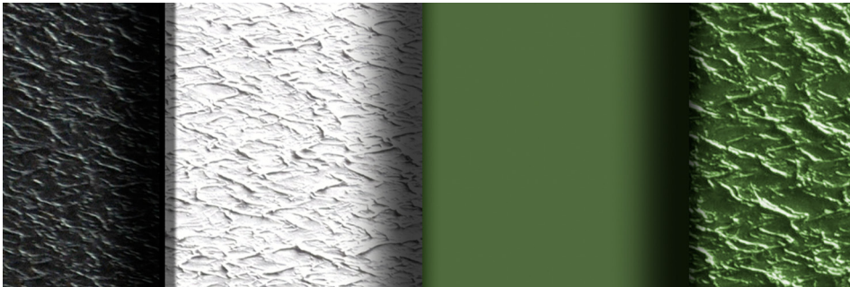
[GSE Geomembrane Products]

GSE is the world's largest manufacturer and installer of geomembrane lining systems and has extensive experience supplying liners for aquaculture facilities.