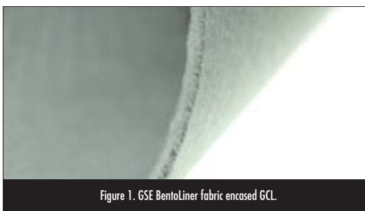
Figure 1. GSE Bentoliner fabric encased GCL.

GSE Bentoliner fabric encased geosynthetic clay liners (GCLs) are industrially manufactured composite materials combining high swelling bentonite clay and geosynthetics for sealing applications. Given their proven hydraulic performance, with a hydraulic conductivity \leq 5 \times 10^{-11} m/s, GSE Bentoliner GCLs can be utilized as a replacement for standard low permeability ( \leq 1 \times 10^{-9} m/s) compacted clay liners (CCLs). Their proven effectiveness on slopes and ease of installation provide several performance and economic benefits as a liner (Figure 1).