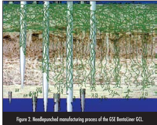
Figure 2. Needle punched manufacturing process of the GSE BentoLiner GCL.

ing up to 1200 strokes/min (Koerner & Koerner, 2002). This is similar to the needlepunched process by which nonwoven geotextiles are manufactured and has been commonly used in the textile industry in the U.S. since the 1950's.